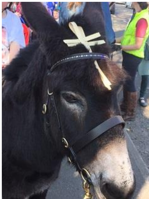
Palm Sunday Donkey